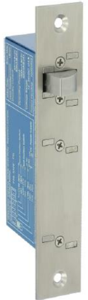
ASA66 Single Action