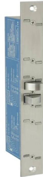
ADA66 Double Action